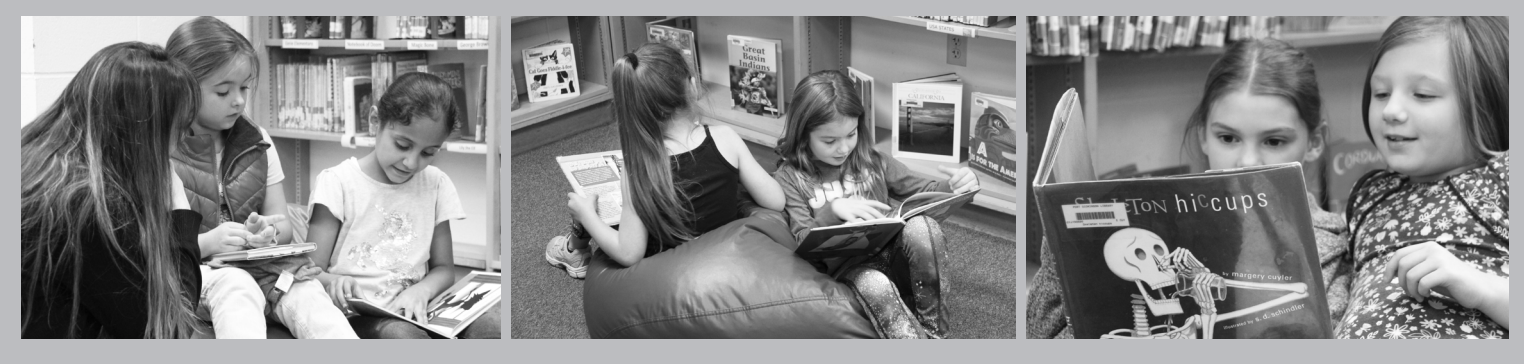
BUILDING SCHOOL-HOME CONNECTIONS AT THE FALL 2019 PORT DICKINSON ELEMENTARY OPEN HOUSE!

"Promise Partner's Reading Place" is a chance for Port Dickinson Elementary students to get lost in a good book. Students have the opportunity to go to the library during their playground time once per six-day cycle. At the library, students can choose a cozy spot, relax and enjoy a variety of stories from paperbacks to audio books. Our library team encourages all who love reading to stop by!